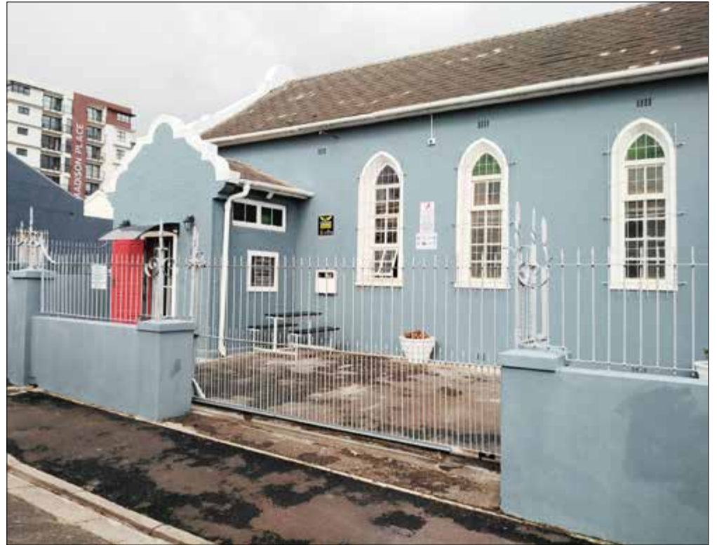
■ The Ibaadur-raghmann Masjied in Eden Road, Observatory.