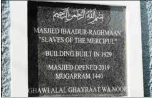
■ Above: A plaque was unveiled at the opening.